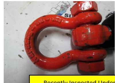
Recently Inspected Under crown snatch block – Swivel Padeye Pin bent (overpulled)